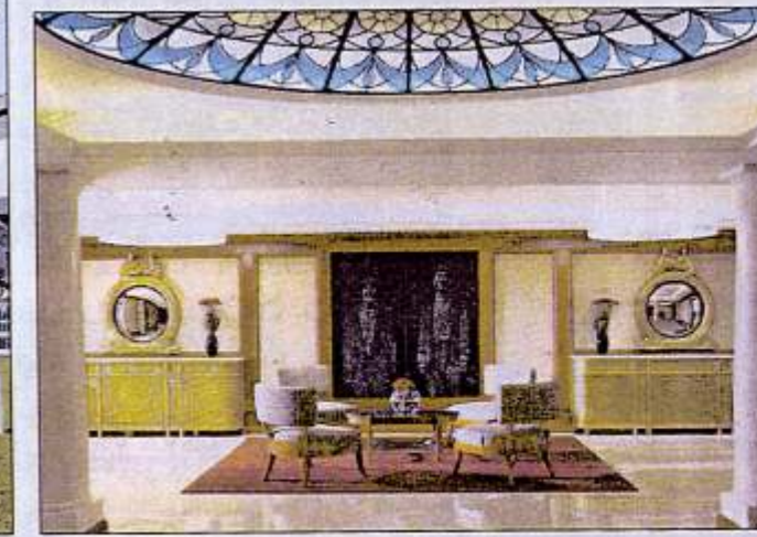
Clockwise from top left: George's Court, Townsend Street, Dublin 2 by KMD Architecture/G&T Crampton Ltd was an 'award winner' in the 'over €10m' category; the interior of Carton House Hotel & Spa, Maynooth, Co Kildare by Murray O'Laoire Architects/Piersie Contracting Ltd was an 'award winner' in the 'heritage' category; Fuse Graphics, 30B Lennox, 27A Sygne St, D8 by Box Architecture Ltd/Irish Conservatories Ltd was an 'award winner' in the 'under €1 million' category; the interior of Shelbourne Hotel, Dublin by Cantrell & Crowley Architects/McNamara & Co Ltd was an 'award winner' in the 'heritage' category; Killanin Stand, Ballybrit, Co Galway by EPR Architects/Michael McNamara & Co Ltd was 'highly commended' in the 'over €10m' category