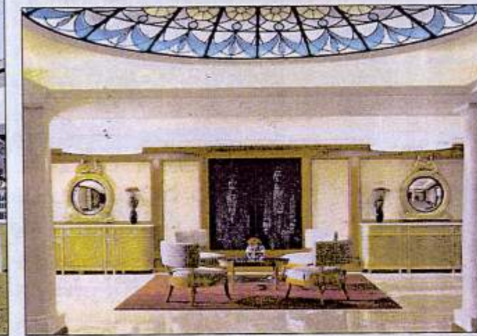
Clockwise from top left: George's Court, Townsend Street, Dublin 2 by KMD Architecture/G&T Crampton Ltd was an 'award winner' in the 'over €10m' category; the interior of Carton House Hotel & Spa, Maynooth, Co Kildare by Murray O'Laoire Architects/Piersie Contracting Ltd was an 'award winner' in the 'heritage' category; Fuse Graphics, 30B Lennox, 27A Sygne St, D8 by Box Architecture Ltd/Irish Conservatories Ltd was an 'award winner' in the 'under €1 million' category; the interior of Shelbourne Hotel, Dublin by Cantrell & Crowley Architects/McNamara & Co Ltd was an 'award winner' in the 'heritage' category; Killanin Stand, Ballybrit, Co Galway by EPR Architects/Michael McNamara & Co Ltd was 'highly commended' in the 'over €10m' category